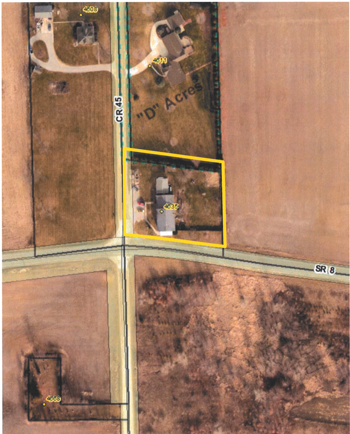
Yellow Outline: Subject Site